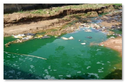
Figure 2: River Majawe, Ibadan (August 10, 2019).

After examining the respondents' sources of drinking water, the study revealed that 49.6% of the respondents source their drinking water from wells (with varying depths). The preponderance in the collection of drinking water from wells is partly attributable to an ineffective public water supply and distribution system in the neighbourhood as is the case with many urban centers in Nigeria. Also, as a function of income level, 29.4% of the respondents source their drinking water from boreholes. Drilling a borehole is expensive and requires more than the usual geo-technical inventory a hand-dug well would typically require. An additional 21.1% of the respondents rely on sachet/bottled water as source for their drinking water. Majority of the research population ($9.6%) rely on underground water as source for their drinking water. The implication of this observation lies in the fact that percolation of chemical laden and noxious effluents could contaminate the ground water sources relied upon by the vast majority of the research population. It is based on this deduction as well as the need to validate or invalidate the perception of the residents on their perceived environmental impact and health effect of the liquid waste discharged from the industry that the study examined the water parameters to describe the water quality in the study area.