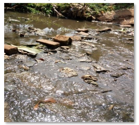
Figure 3: A Drainage Channel at Majewe, Ibadan.

In table 3, among the parameter examined is pH, the study revealed that the well water has average pH value of 5.62mgl. The surface stream water sample revealed 7.13pH value while brewery effluent had 7.37pH value. The findings revealed that the well water is slightly acidic while the surface water and waste water is tending towards alkaline. However, the values were within the permissible limits of NESREA and WHO's, 6 - 9 and 6.6 - 8.5 respectively. Hence, the pH of the ground water (GW1 and 2) poses no life threat to people using the water for domestic purposes as well as and the aquatic habitants. Result from the temperature analysis uncovered that the well water had an average value of 25.5^{\circ C} surface water has 25.4^{\circ C} while the brewery effluent revealed 26.7^{\circ C} . However, this falls within the NESREA permissible limit of less than 40^{\circ C} , however, the whole samples were higher than WHO limit which can affect the water quality.